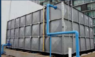
WATER TANK CLEANING & SERVICING WORKS