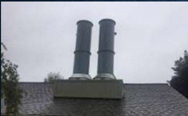
CHIMNEY SERVICING WORKS