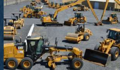
HEAVY EQUIPMENTS SUPPLIES