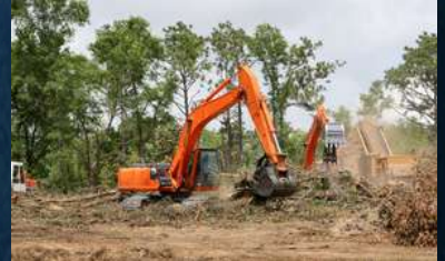
LAND CLEARANCE WORKS