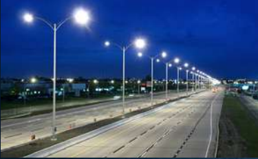
STREET LIGHT WORKS